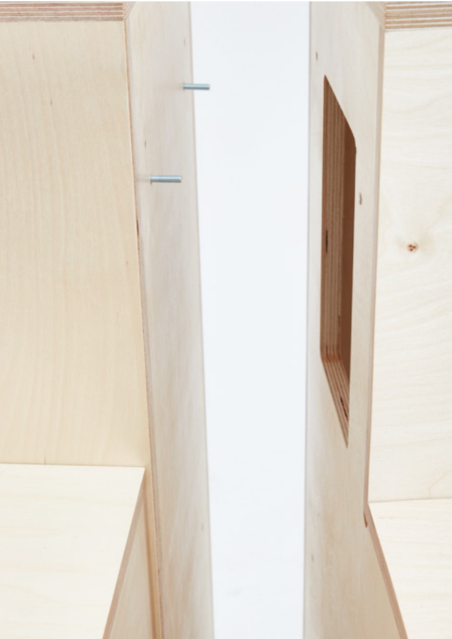
Simple on-site assembly