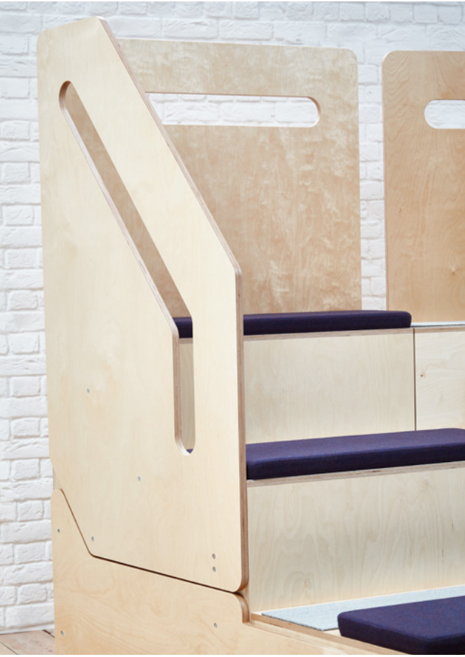
Back & side balustrades