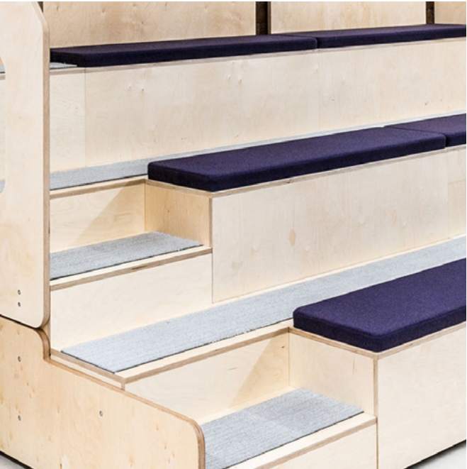
Poplar veneer plywood construction