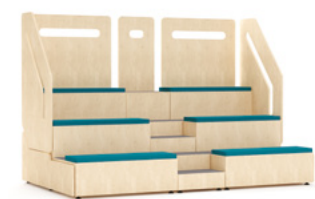
Configuration: 12 seat