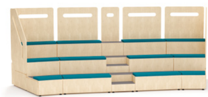
Configuration: 20 seat