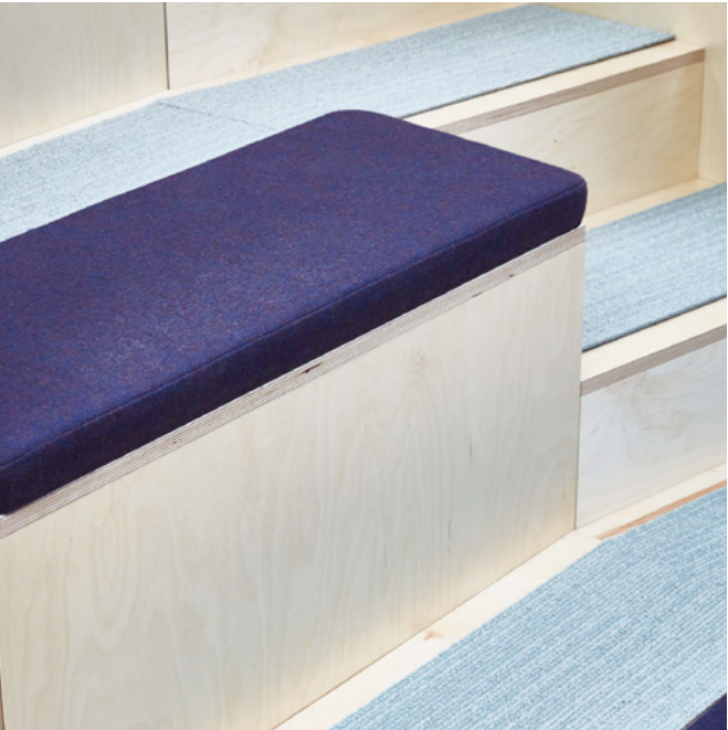
Seat cushions & floor covering