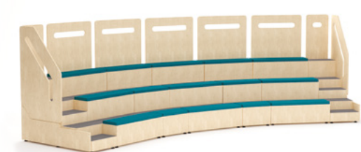
Configuration: 26 seat