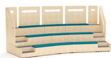
Configuration: 16 seat