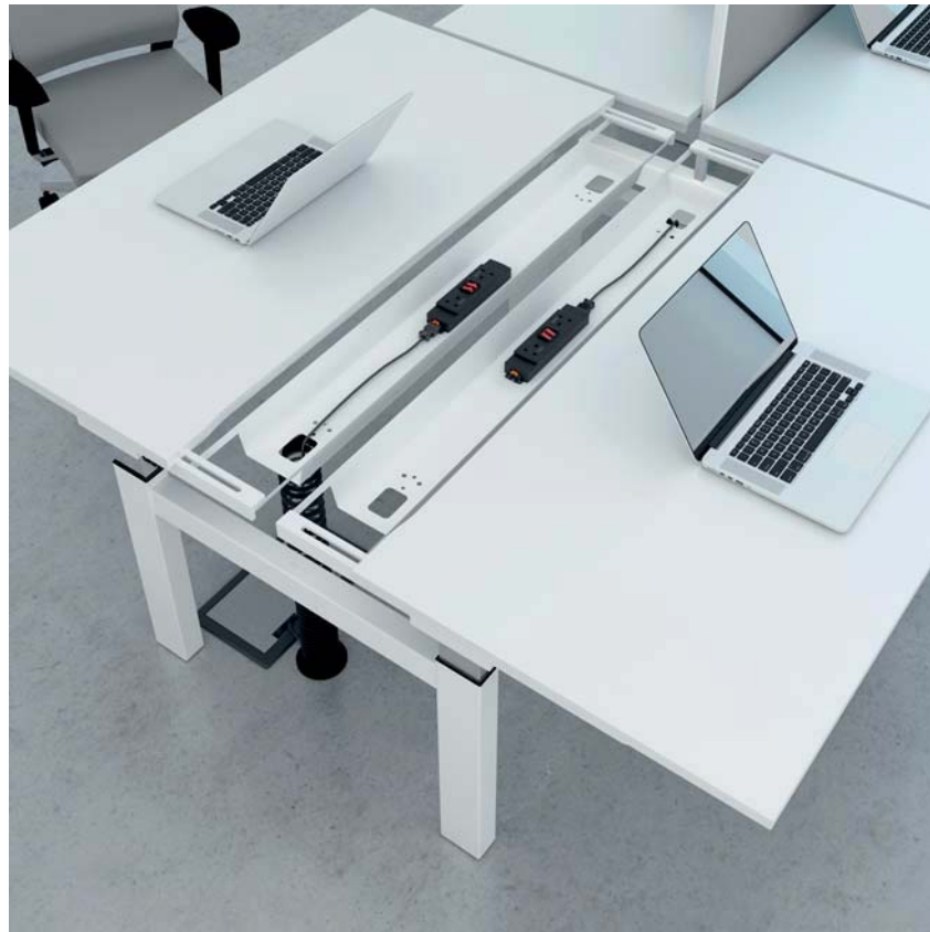
Sliding tops are supplied as standard on double benches. The cable tray is welded in a fixed position offering high capacity, horizontal wire management.