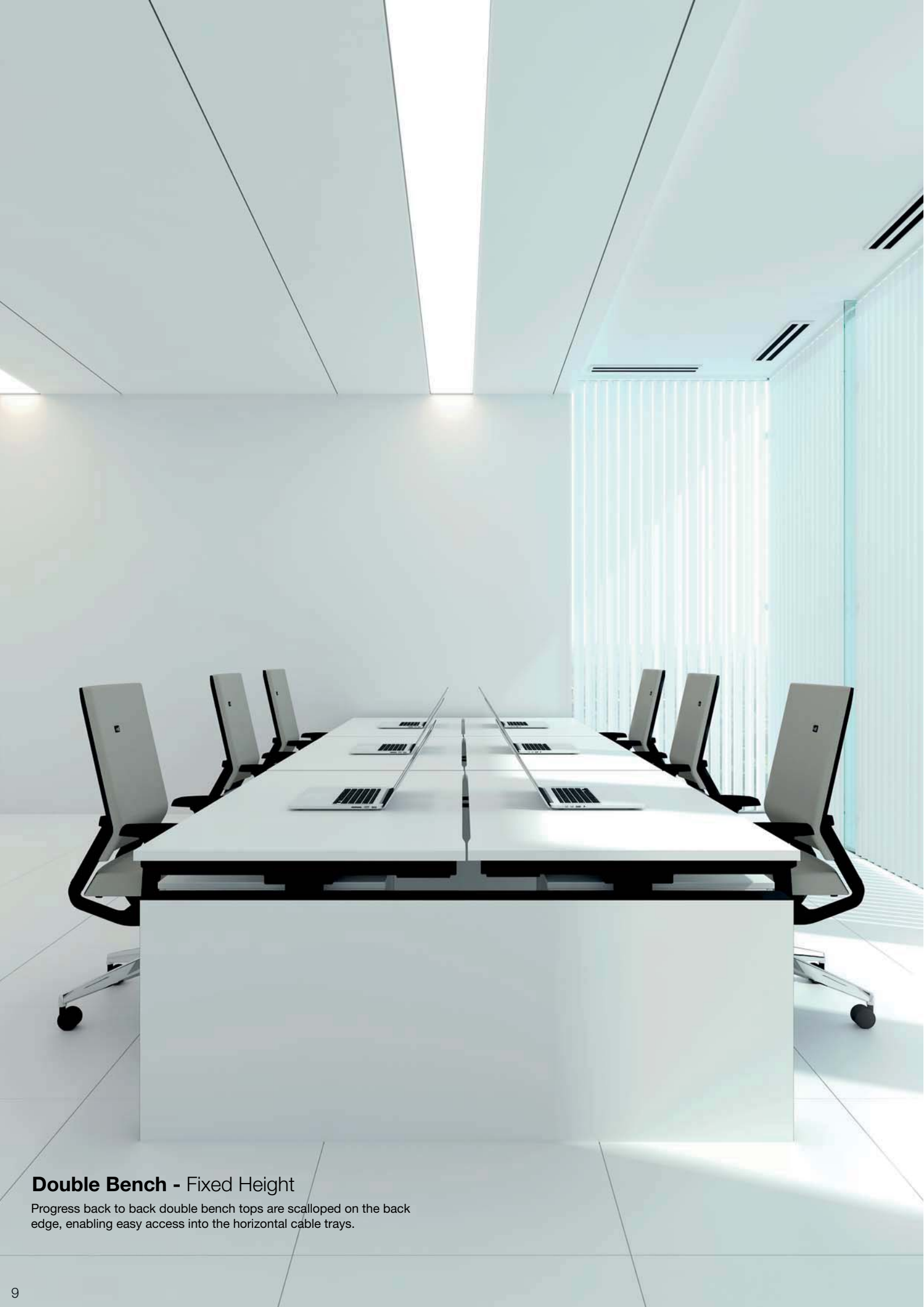
Double Bench - Fixed Height Progress back to back double bench tops are scalloped on the back edge, enabling easy access into the horizontal cable trays.