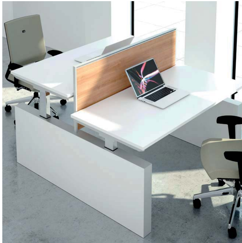
Screen panels can be finished in MFC to complement or contrast the adjacent work surfaces.