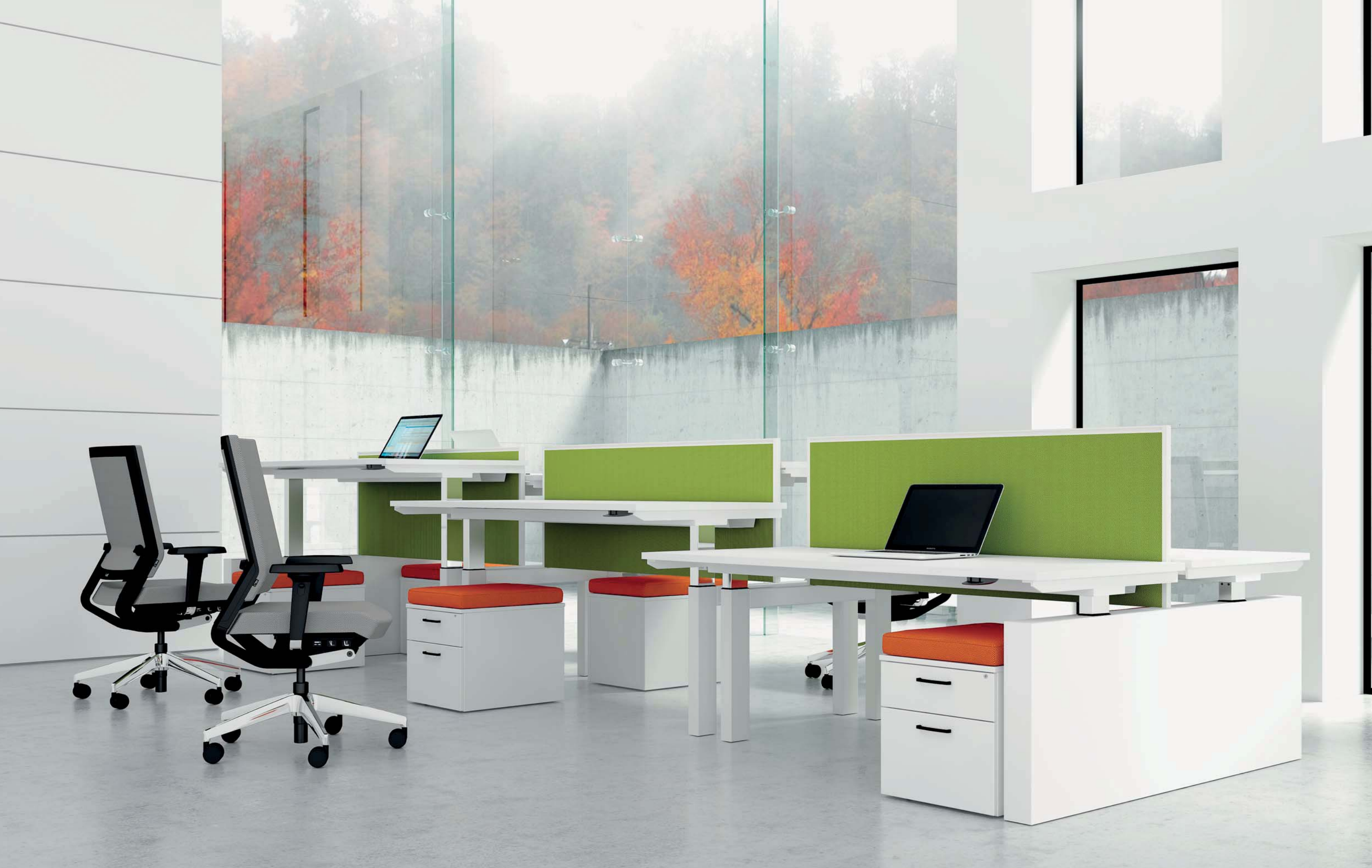
Double Bench - Height Adjustable Double benches provide back to back workstations, available with either gas strut and fixed height workstations, according to a clients requirements.