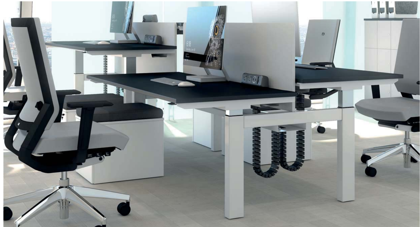
Progress Adjustable & Fixed Height Bench