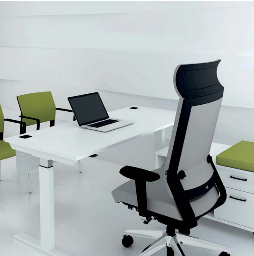
The i-sit ergonomic seating range complements Progress desking, providing the user with a high level of personal adjustment.