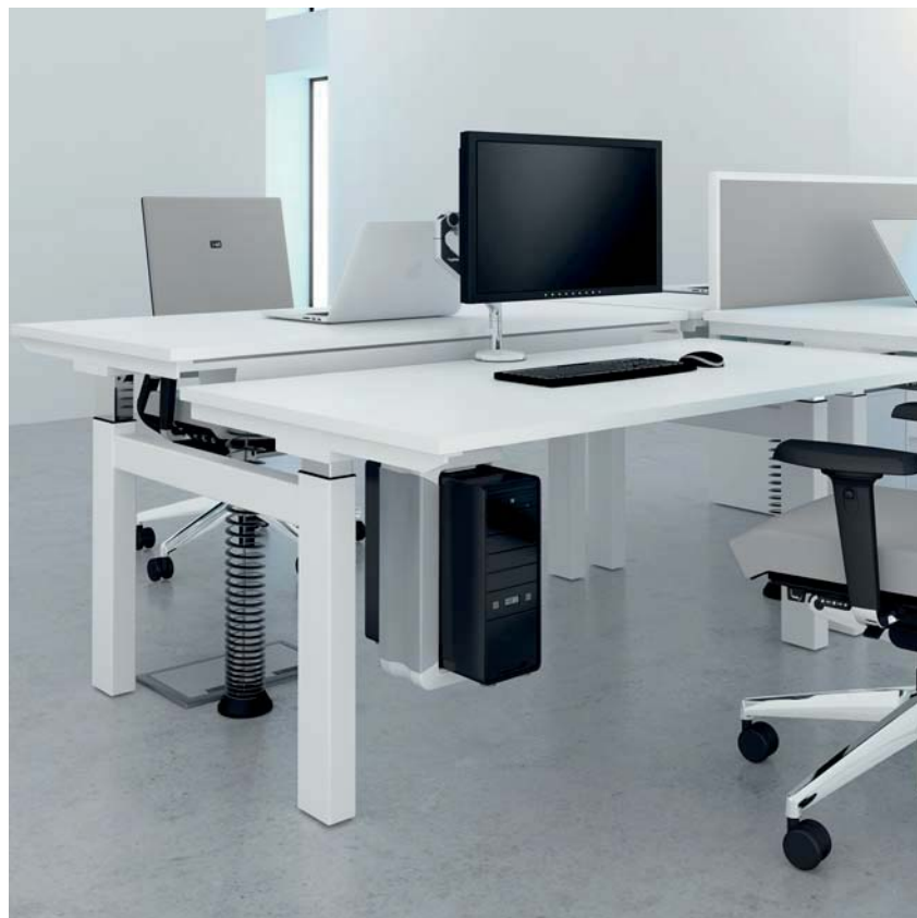
An optional spiral cable spine offers vertical wire management. Elite CPU holders are compatible with the Progress frame, offering an integrated solution.