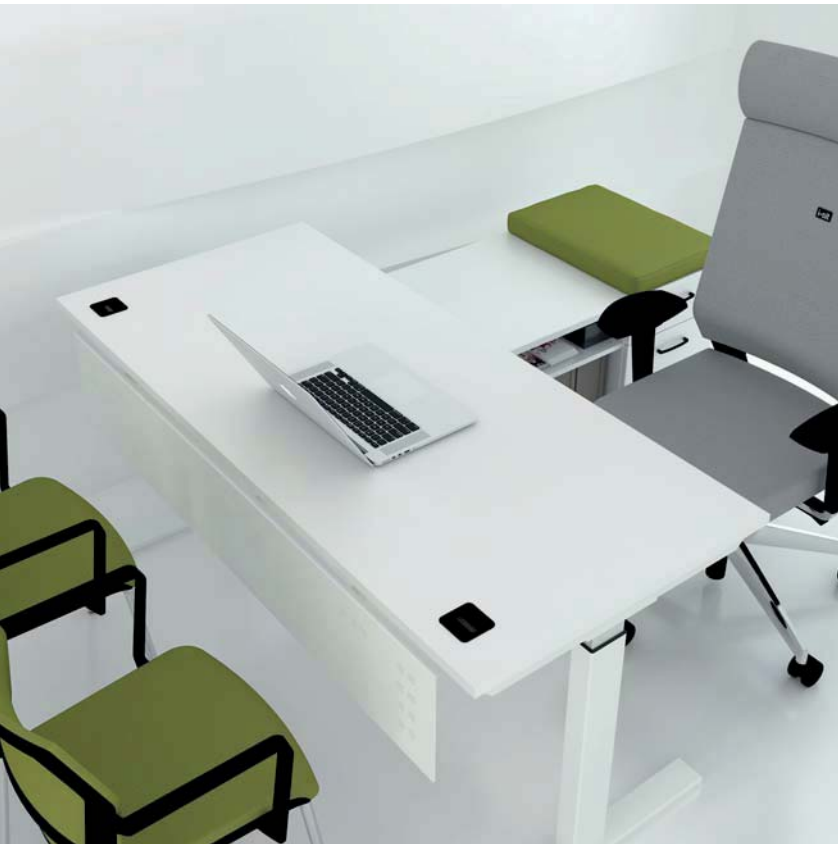
Optional modesty panels are available to introduce privacy, where required.