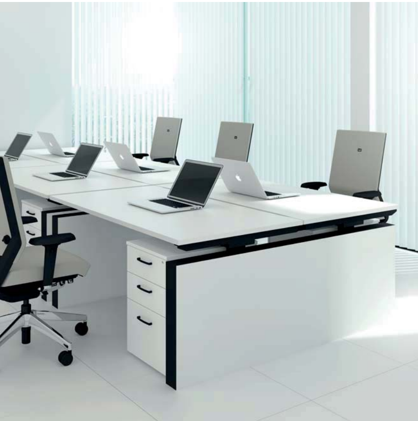
Optional slab ends offer privacy at the end of a cluster.