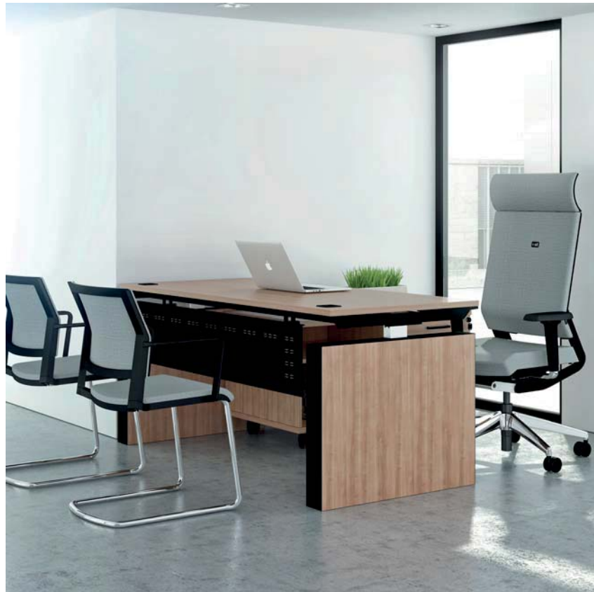
Optional slab ends are available, providing a more executive configuration.