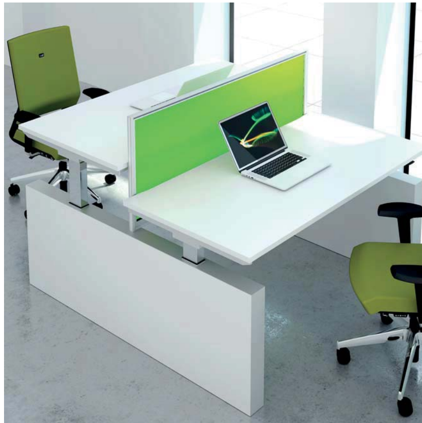
Acrylic screens are available in six coloured options.