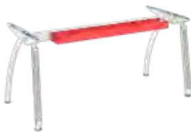
CWMT16 Illustrated in red

Metalwork: Add 0% for Silver, Black Graphite and White - Add 15% for Chrome Effect