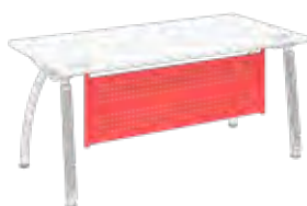
CMP16 Illustrated in red

CSCMT120 - For C120 - 1600w x 660d x 740h _____